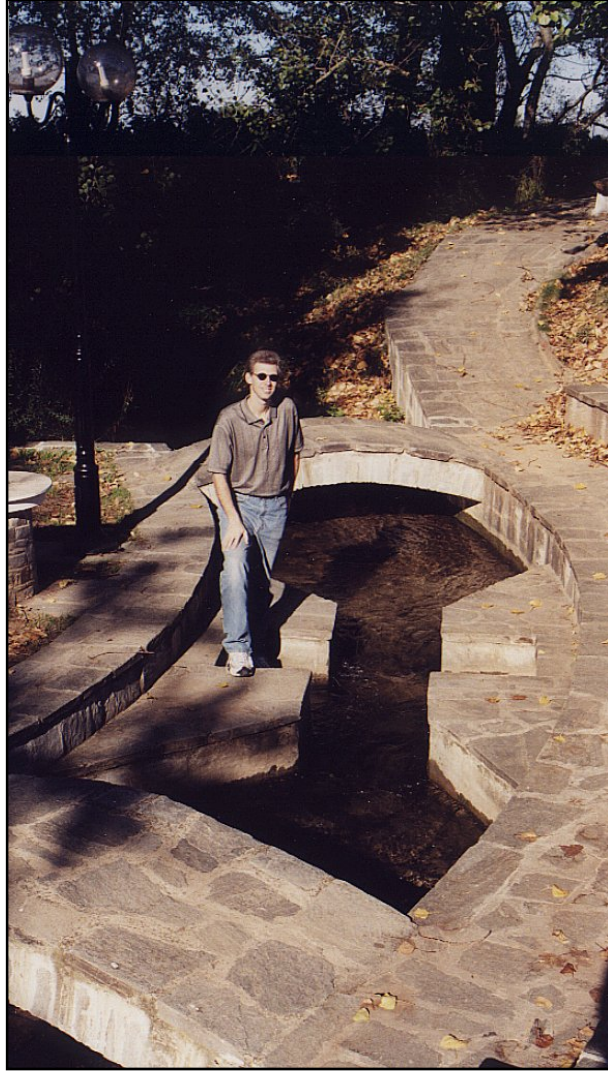
Philippi Stream where Lydia was baptized into Christ

The true church, the radicals insisted, is always the community of saints, dedicated disciples, in a wicked world. Like the missionary monks of the Middle ages, the Anabaptists would shape their society by their example of radical discipleship – if necessary, even by death.