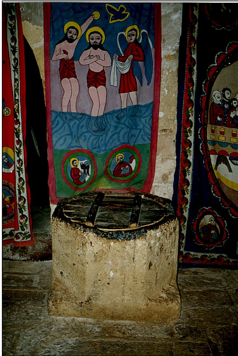
Ancient Mardin Syrian Orthodox Infant Immersion Baptistry