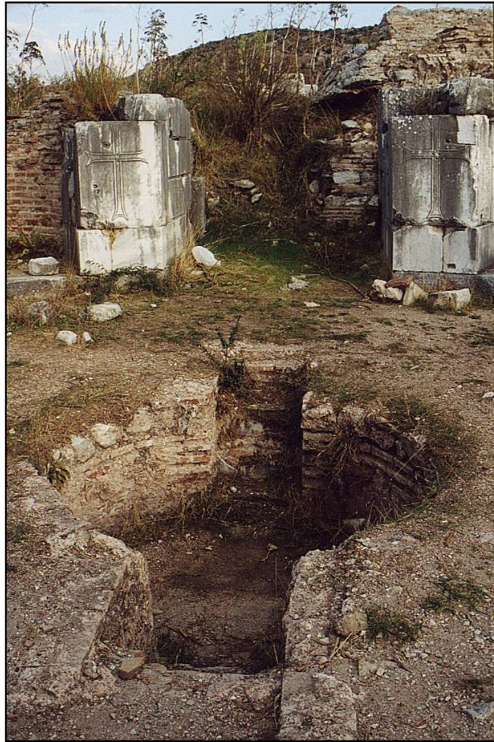
Ephesus Baptistery with Steps Leading Down to Water

This mystery is great; but I am speaking with reference to Christ and the church (Ephesians 5:25-32).