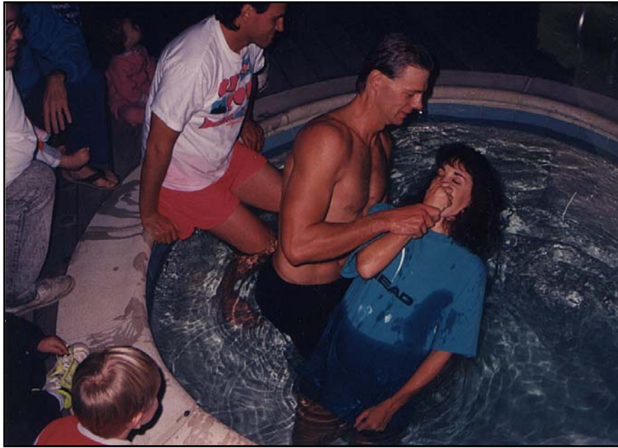
Hot Tub Baptism

Yet many believers in Christ and entire church denominations today say that the mode of the “sacrament” does not matter. Baptism is not just a matter of semantics. Baptism is a part of the salvation process. If people place their eternal life and others’ destiny on Jesus’ words, they should want to know the truth. A truth seeker should want to know the actual meaning, not the evolution of a word for the past two thousand years. Many denominations admit that sprinkling or pouring is not what baptism meant during the New Testament church, so why do they still persist in it today? Even one of the greatest founders of the Protestant Reformation, Martin Luther, stated: “First, baptism is a Greek word. In Latin it can be translated immersion, as when something is plunged into water that it may be completely covered with water.” 42 Does not James 4:17 say that the good they know they should do, but don’t do, is sin? But Luther dealt with that scripture as he did the whole book of James: He wanted to disassociate it from the rest of his Bible because it was too works focused . John Calvin (another Reformation movement leader) maintained the same refusal to accept what the Bible states about