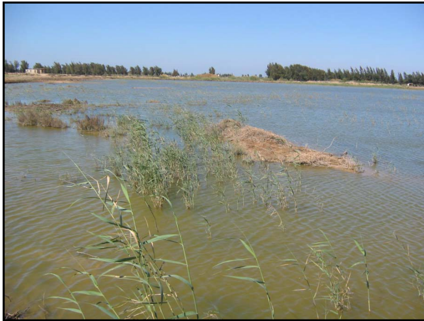
Yam Suf “Sea of Reeds” Possible Location Near Goshen, Egypt