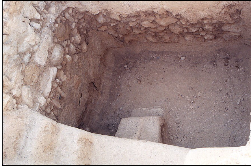
Qumran Mikvah for Ceremonial Cleansing Immersions

baptism the Israelites used for those Gentiles who were converted to Judaism). 2