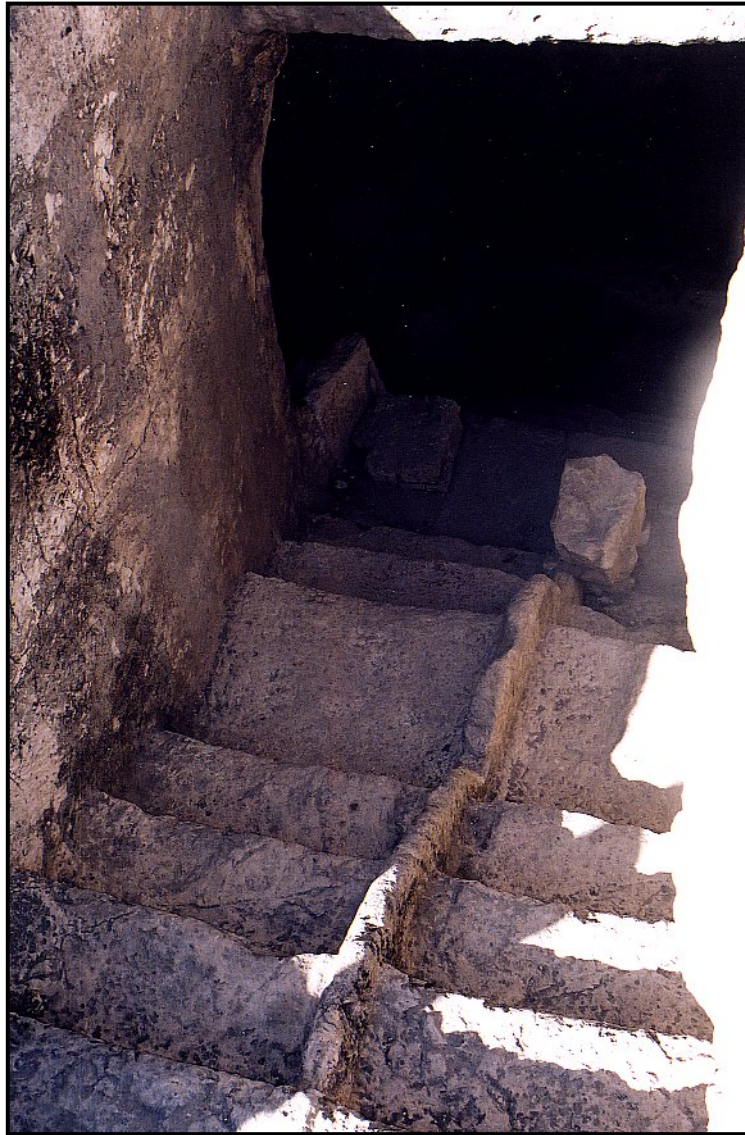
Temple Mount Southern Wall Mikvah for ceremonial washings probably used on the first Pentecost Day of Jesus' church (Acts 2)

heart” (Acts 2:37). This occurred after the audience realized that the result of their sin was the crucifixion of Jesus.